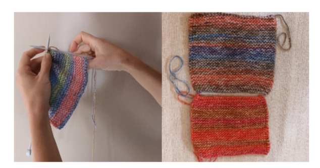
Figure 2 The action of knitting as enactment of phenomenological embodiment

enactment of constructing a unified narrative (knitted piece), emphasising the interrelatedness (blended colours of yarn) of various person characteristics, life circumstances and personal history, life roles and significant transitions, relationships, needs, challenges, environmental events and opportunities. The action of knitting becomes an enactment of a phenomenologically embodied whole, that is the weaving of intricately connected lifeworld parts, such as personal, situational and relational factors into an integrative and meaningful lifeworld reality.