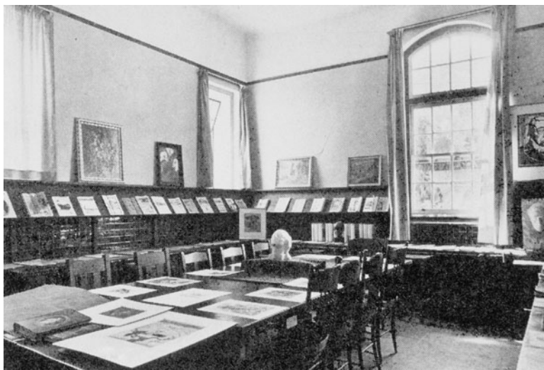
Figure 2: Photograph of Afrikaans Art and Culture classroom, 1932.

Culture lecture room in the Old Arts Building ( Figure 2 ), others were hung in the corridors of the Merensky Library building, designed by Moerdyk.