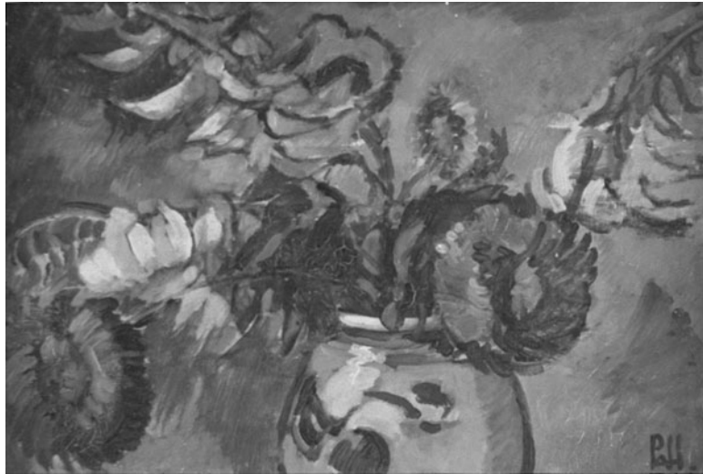
Figure 4: A. Hendriks, Chrysanthemums and Asters , 1932. Oil on canvas - 245 x 350 mm. (Art Collection, University of Pretoria).