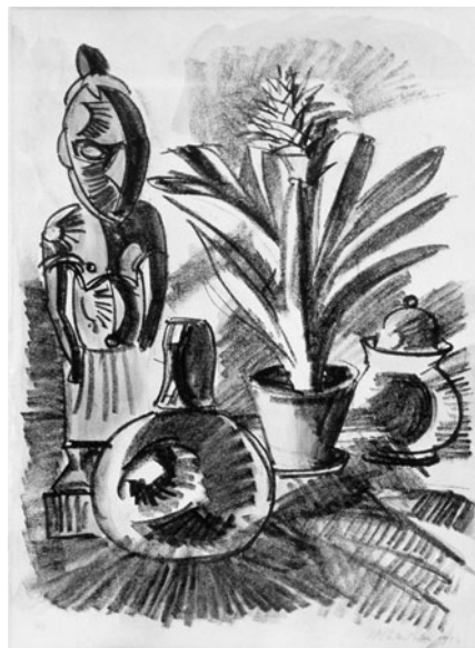
Figure 5: M. Pechstein, Still Life with Figurine , 1923. Polychrome lithograph - 500 x 374 mm. (Art Collection, University of Pretoria).