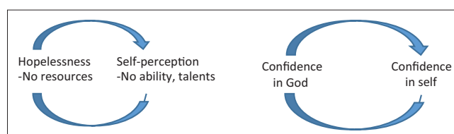
FIGURE 2: The poverty cycle and the cycle of restoration and renewal (own research)

The success of a poverty intervention will ultimately rest upon the exercise of stewardship and in the fulfilment of the biblical mandate of stewardship (Gn 2:15; Ex 19:4–6; Mt 1:6; 1 Pt 2:5; 9–10, 4:10–11; Rv 5:10, 20:6).