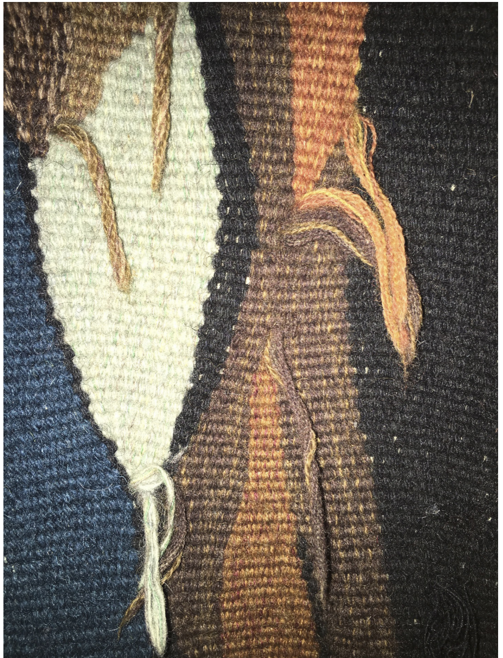
FIGURE N° 8