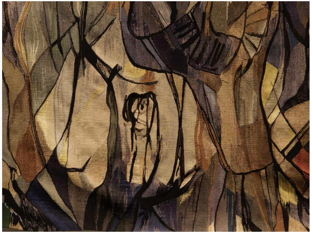
FIGURE N° 15