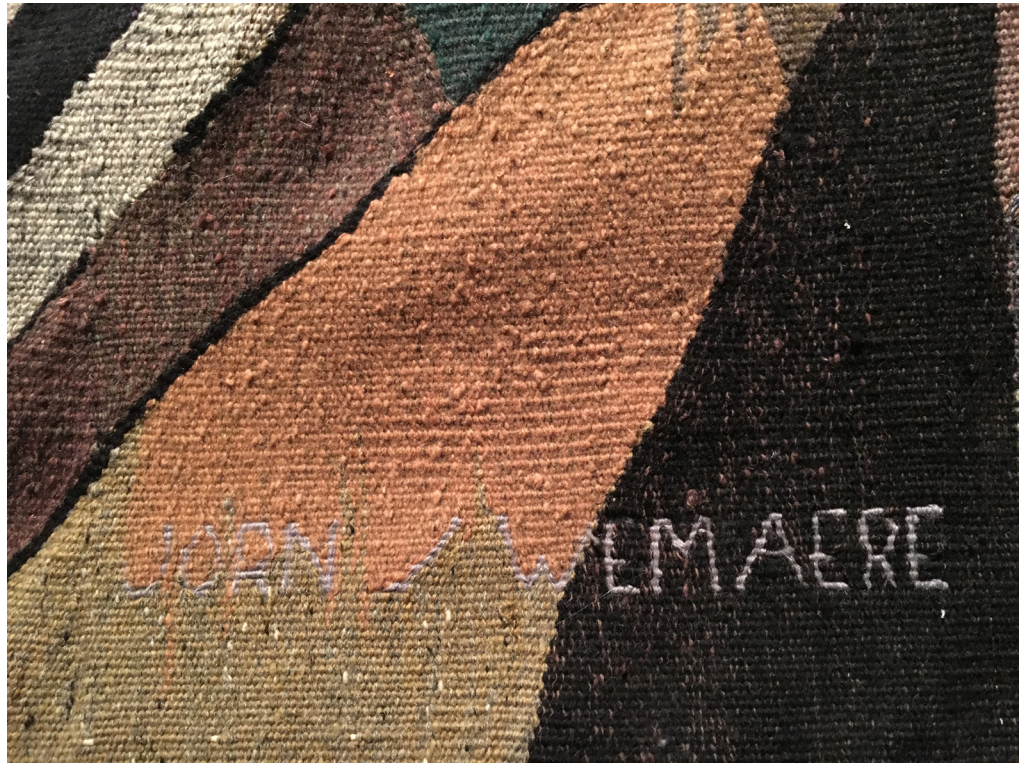
FIGURE Nº 19