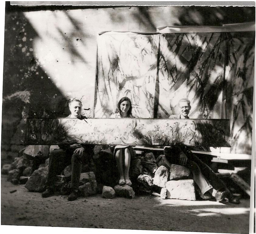
FIGURE N° 9