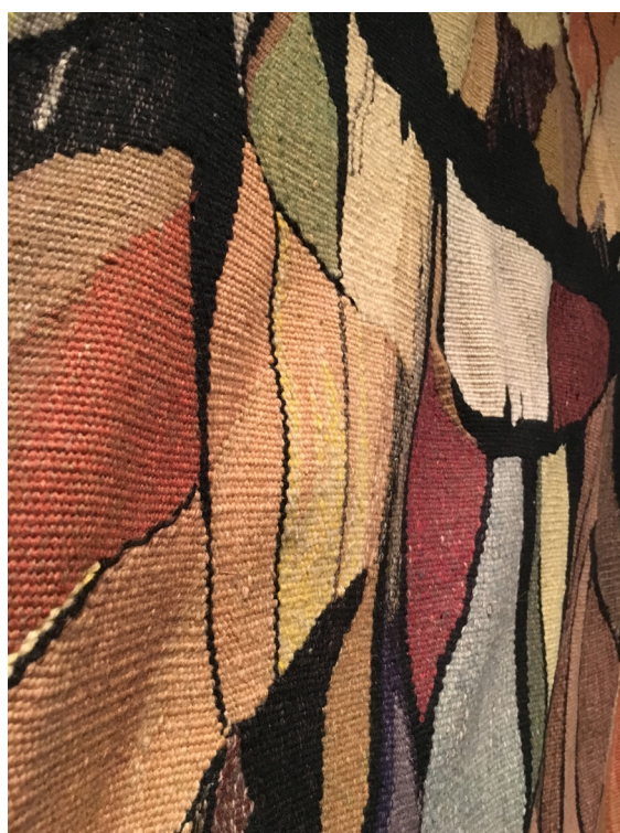
FIGURE N° 14