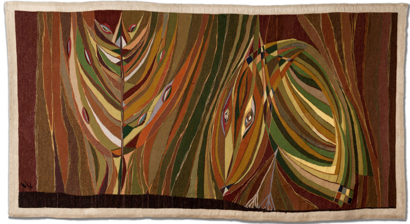
FIGURE N° 5