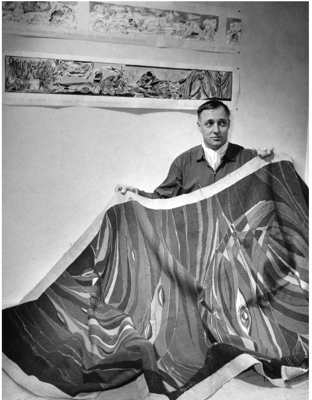
FIGURE N° 11