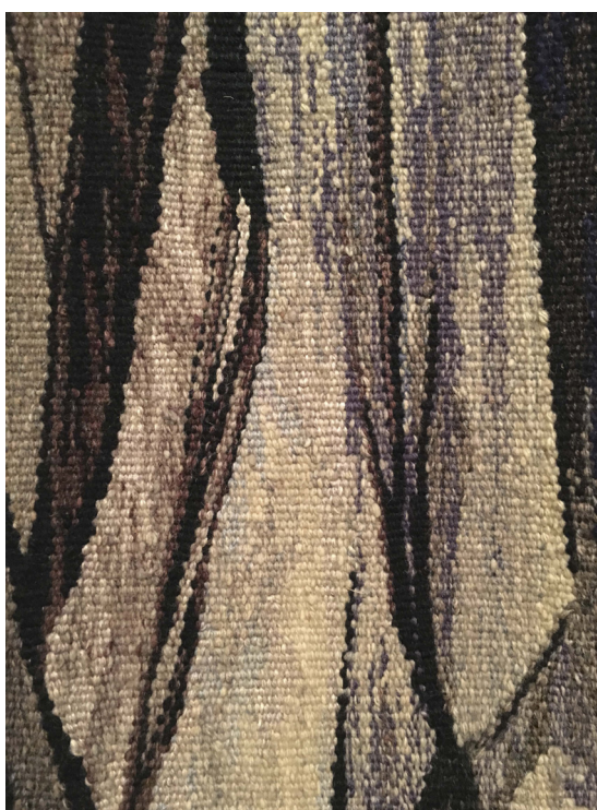
FIGURE N° 18