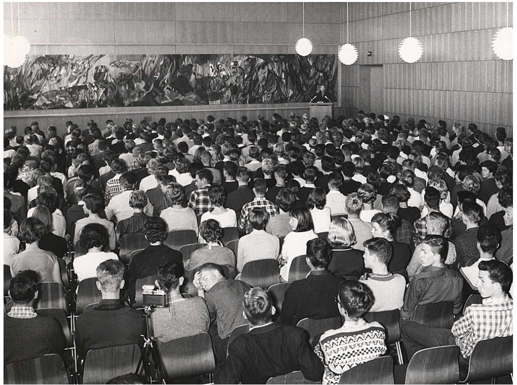
FIGURE Nº 2