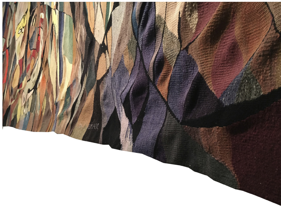
FIGURE N° 13