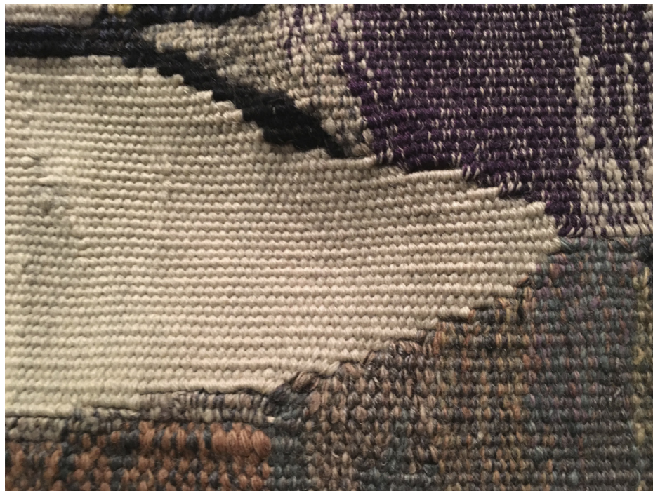
FIGURE N° 17