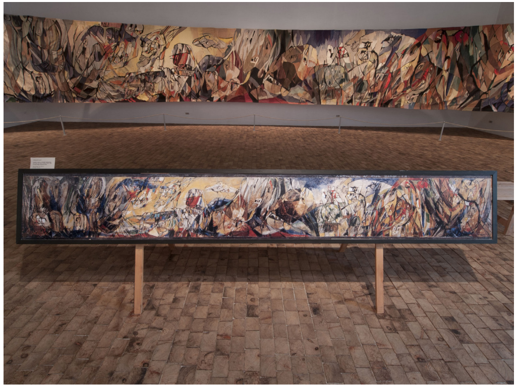
FIGURE N° 16