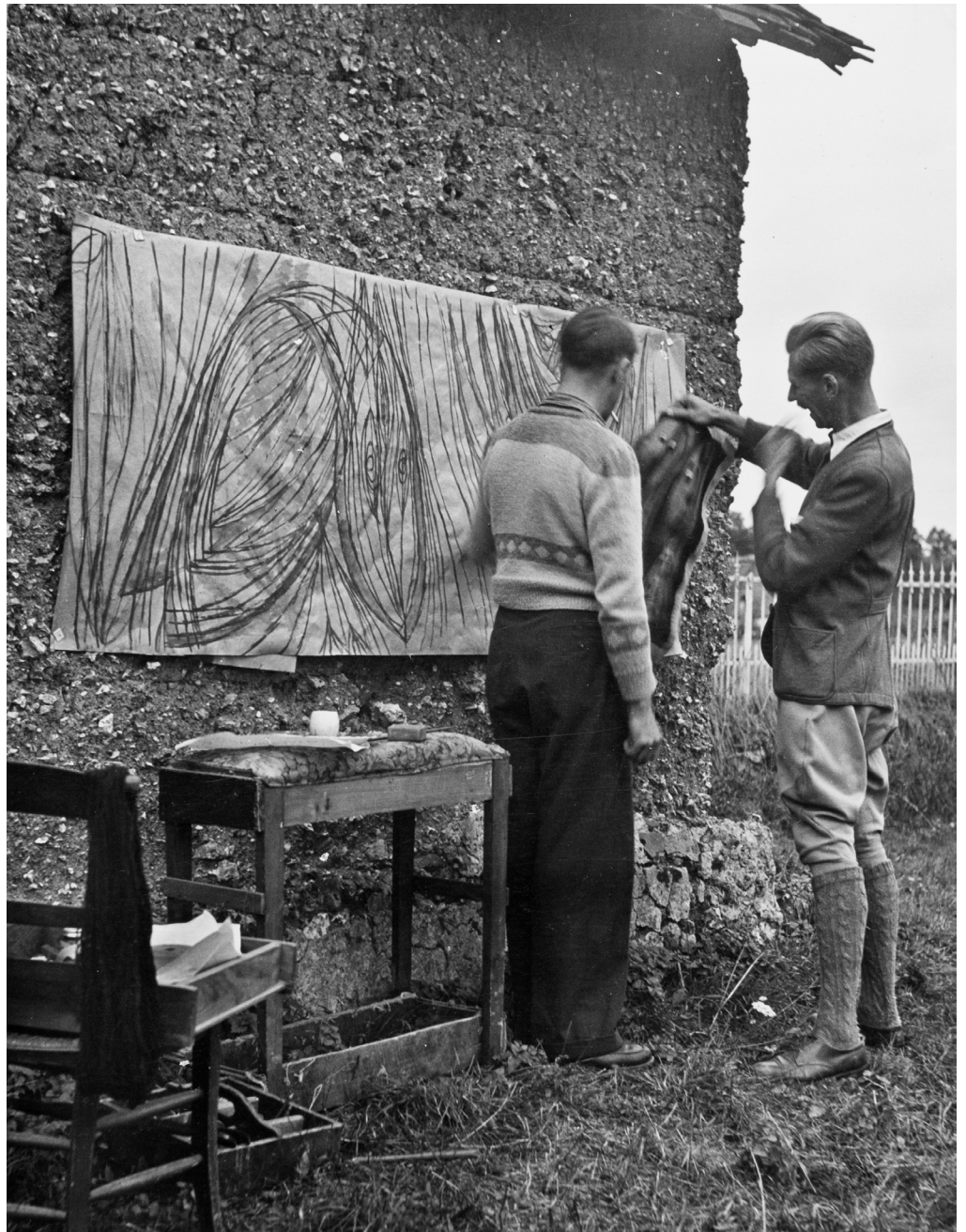
FIGURE N° 4