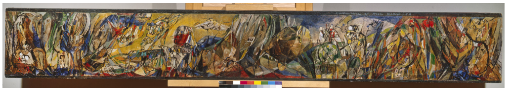
FIGURE N° 12

Jorn with sketches for Le Long Voyage , 1959.