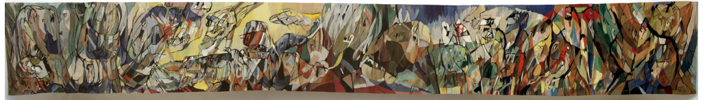
FIGURE N° 6