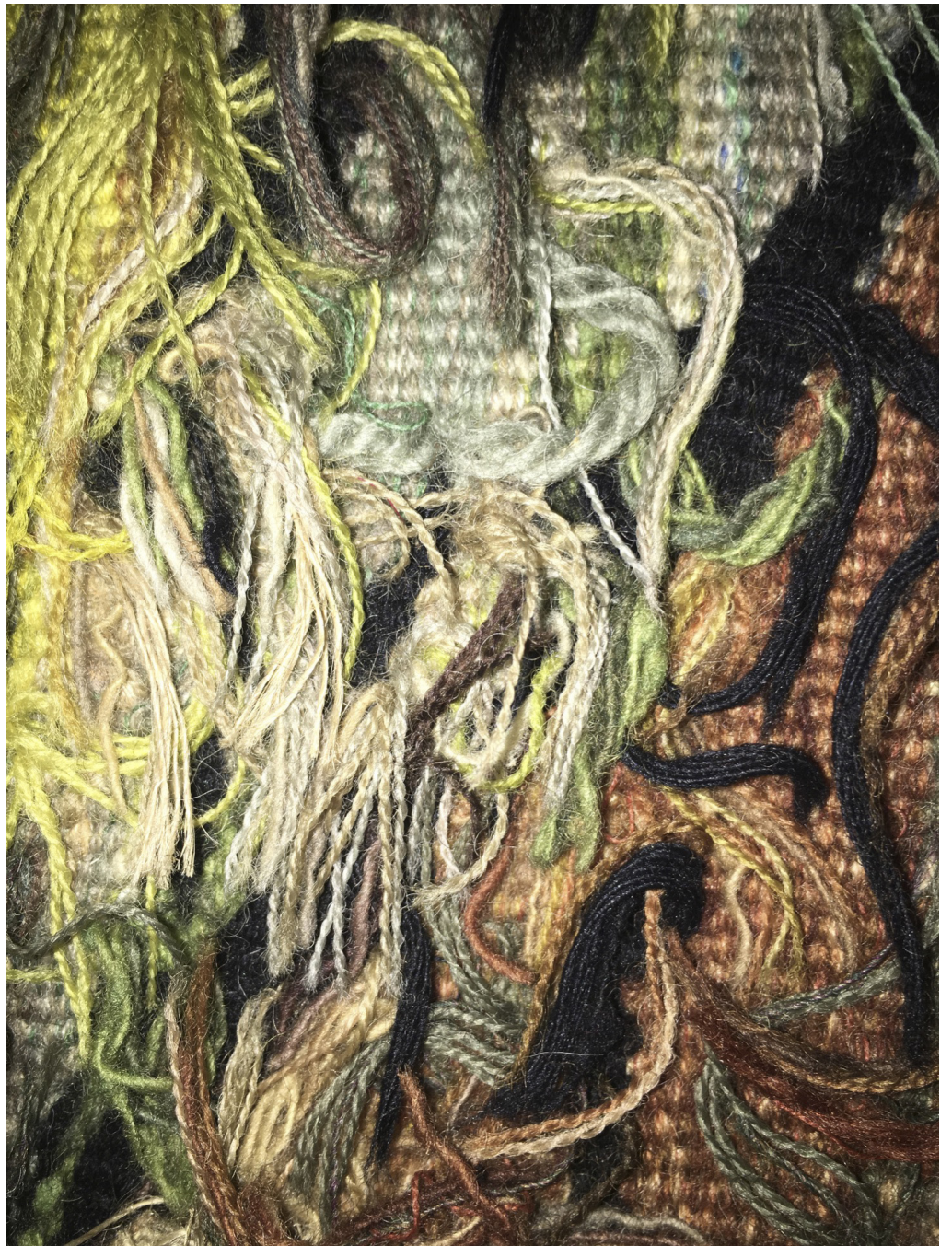
FIGURE N° 7