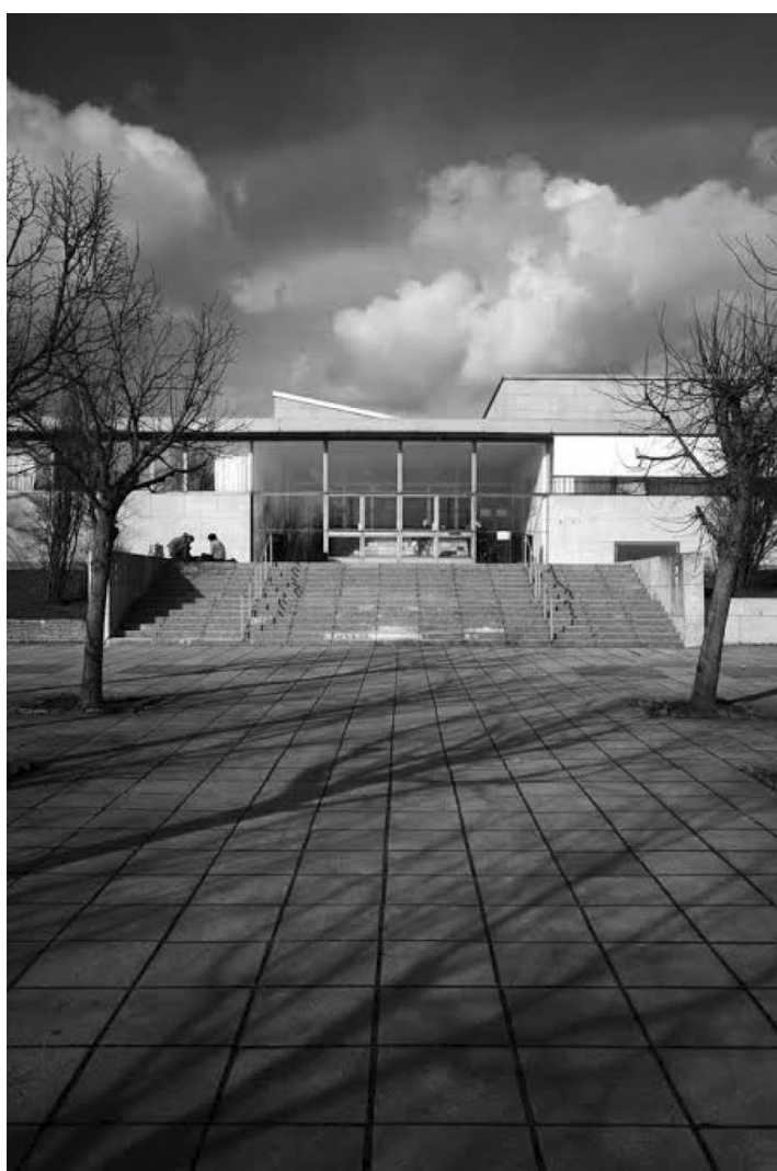
FIGURE Nº 1