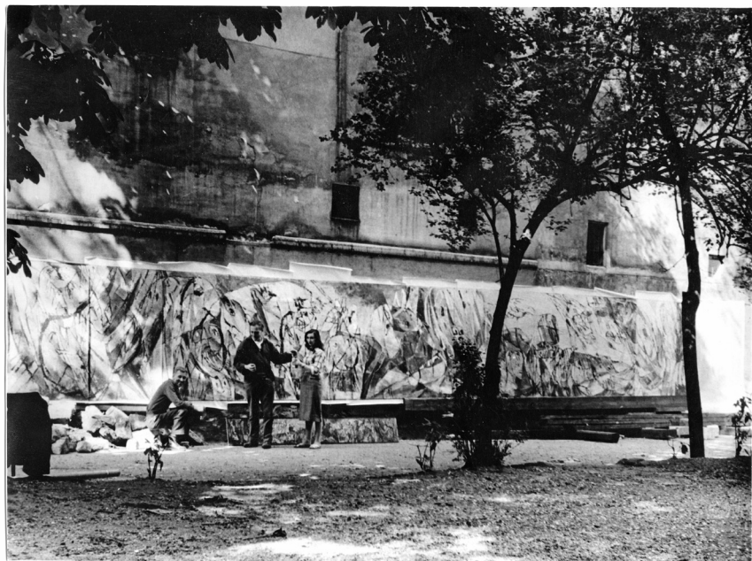
FIGURE N° 10