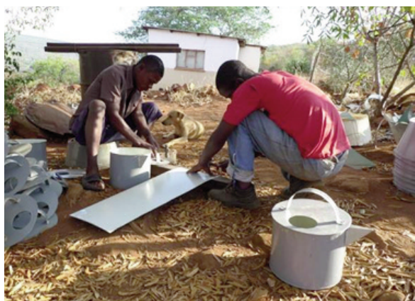
Figure 7: Local artisans manufacturing the 'Chichakuluma' kettle.

A portion of the investigation of the area was also to ascertain the potential of local artisans to be involved in the manufacturing process to make solutions locally. It was found that there are two skilled craftsmen in the HaMakuya village from Mozambique, who live in the area and manufacture the 'Chichakuluma' kettle (Figure 7), which is found in the majority of households in HaMakuya. The sheet metal used for making the kettles is purchased from Johannesburg and delivered to the village once a month. All components of the kettle are made using hand tools at the artisan's outdoor manufacturing site.