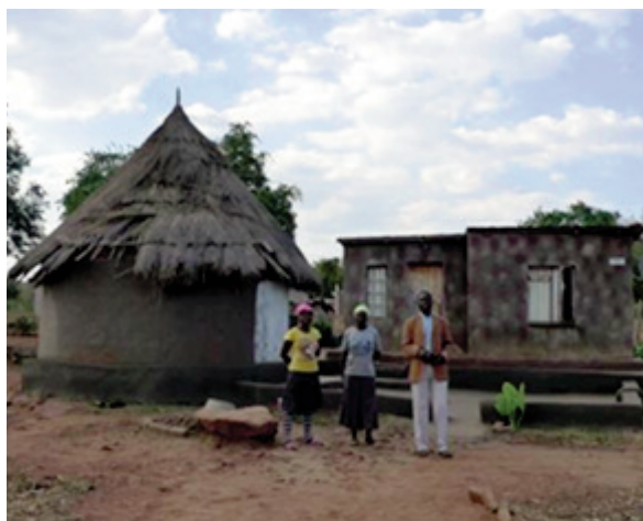
Figure 1: Typical household layout in HaMakuya village showing a detached thatched kitchen and an electrified brick house.

The majority of households in HaMakuya depend on fuelwood as a primary energy source to meet their basic heating and cooking needs. The fuel is used in an open three-legged grate stove. Cooking is generally done in closed cooking huts, or outdoors in an area allocated for cooking.