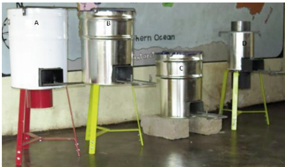
Figure 3: The Tshulu stoves: (A) Tshulu2 with ash remover; (B and C) RS1 and RS2 based on the Aprovecho designs; (D) the smaller design Tshulu1.