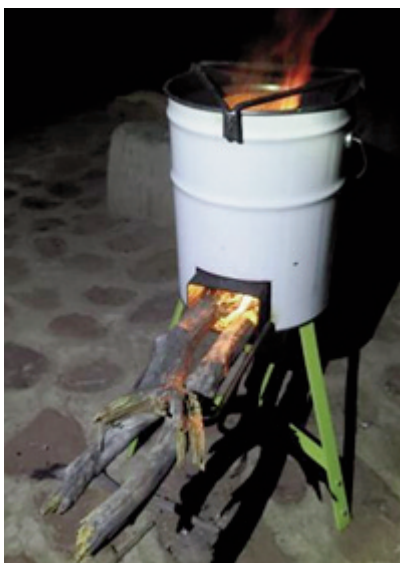
Figure 6: Tshulu stove with improved design principle.

tographs were taken of one of the interpreters working at the stove at sitting height and at standing height. These were then printed out and the participants were asked to blind vote on which height was most preferable. The blind vote revealed that 50% of the participants preferred cooking while standing and that 50% preferred cooking while seated.