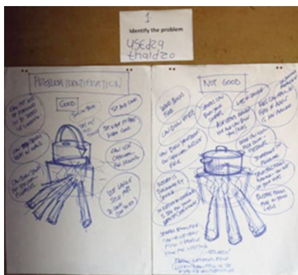
Figure 4: Drawings to discuss the merits and demerits of current cooking technologies.

cient in wood consumption. Again, there was a safety concern and an implication for health that they had experienced over time.