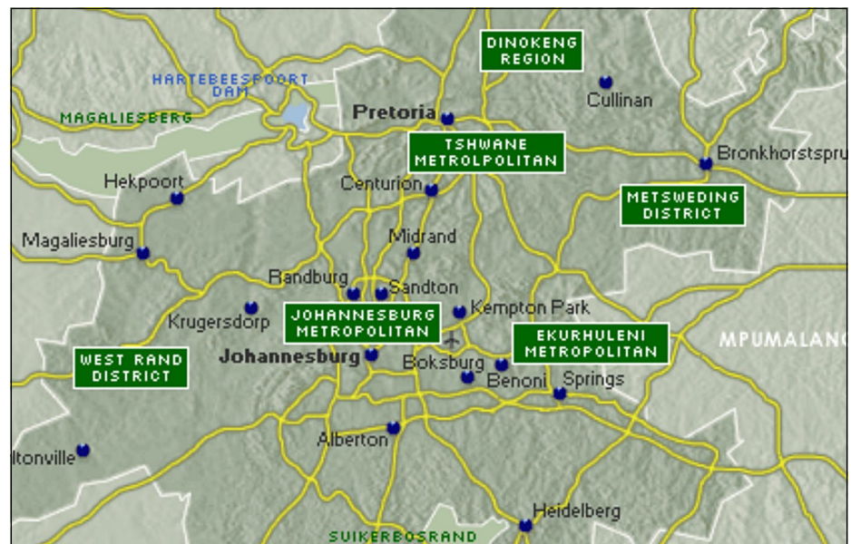
Figure 2 Map of Gauteng showing the City of Johannesburg Metropolitan (SA Venues 2021)

Master Plan 2013, the CoJ Draft NMT Policy, and the Department of Transport's NMT Facility Guidelines 2014. Another international guideline and planning document was the 2009 Connect2Greenways Guidelines, Sustrans, United Kingdom (Wray & Gotz 2014).