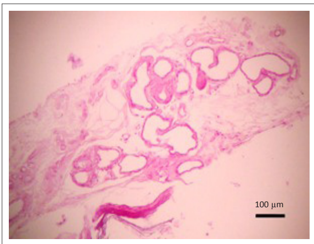
FIGURE 2: The cyst was lined with stratified squamous epithelium and filled with desquamated keratin.