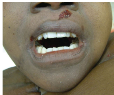
Figure 2: The victim showing the lesion in the right corner of the mouth and below the left nostril.