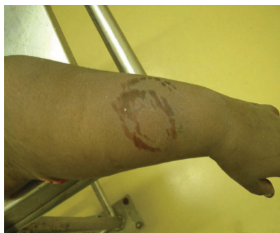
Figure 1: The oval pattern of the bite marks on the left arm showing two bite mark patterns (ABFO mm scale).