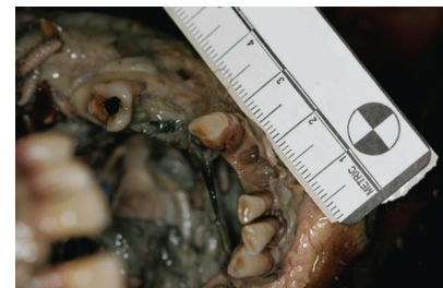
Figure 1: Lower jaw of deceased showing mesial remains of amalgam filling in the 36.