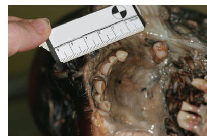
Figure 2: Upper jaw of deceased