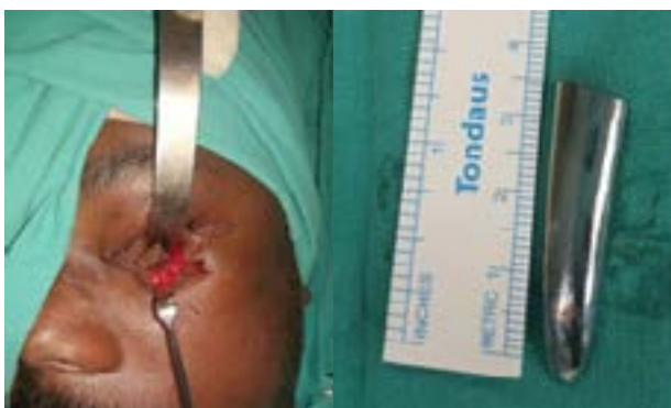
Figure 5 and 6. Door handle being removed through the lower eyelid incision; the tip of the door handle after being removed

The area was thoroughly assessed for any fractures, and none were noted. The wound was debrided and irrigated with normal saline. The wound was sutured in layers with 3.0 vicryl rapid and 5.0 nylon for the skin.