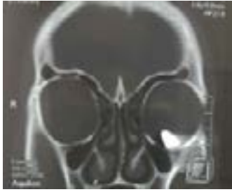
Figure 3. Coronal view of the CT-Scan indicating the door handle above the infra-orbital rim.

The patient was taken to theatre for removal of the object under general anesthesia via an extra-oral approach, consent having been obtained from the patient for both the procedure and the use of the clinical material for academic purposes.