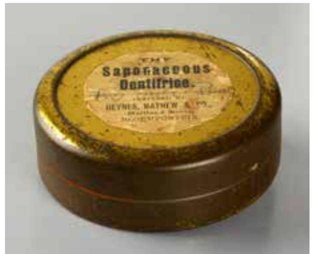
Figure 7B. Heynes Saponaceous Dentifrice tin.