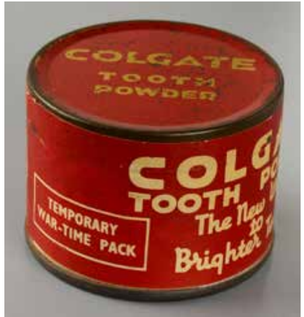
Figure 7A. Colgate Tooth Paste - War Time Pack tin.