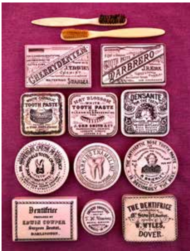
Figure 2. Dental images and toothbrushes.