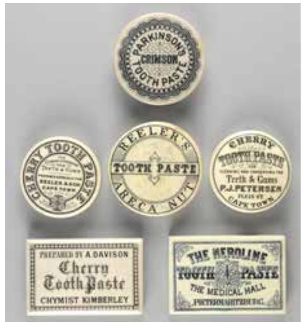
Figure 3. RSA pot lids.