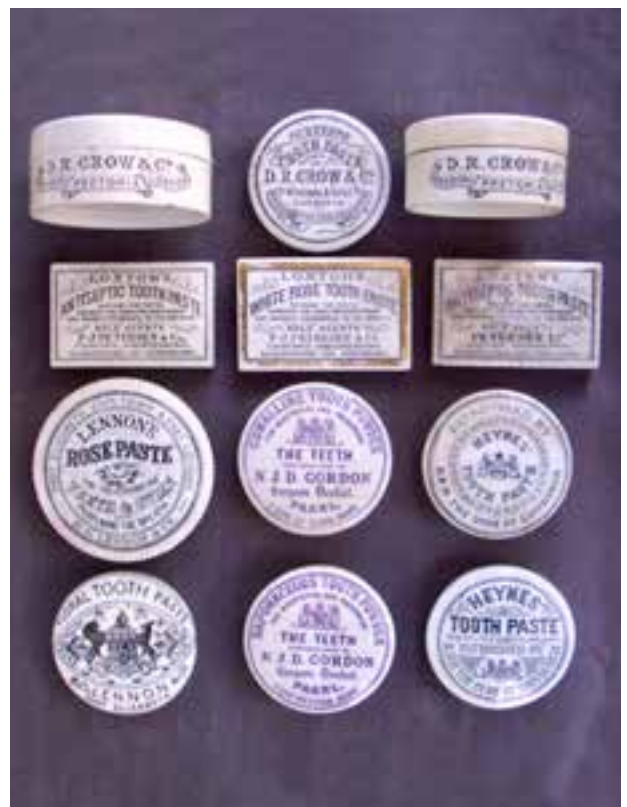
Figure 4. RSA pot lids.