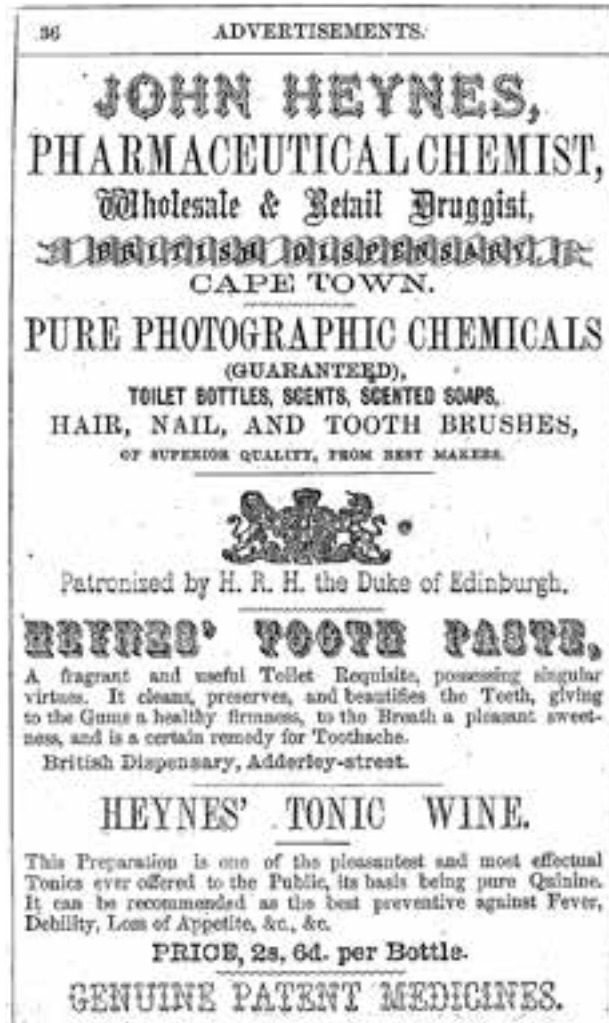
Figure 5. Heynes advert.

The most beautiful, partially coloured, South African lid was used by J.H. Cooper who were chemists in central Cape Town and Sea Point from 1883 to 1925. Their Cherry Tooth Paste lid features brightly coloured cherries and leaves, surrounded by black and white text. The colour was possibly painted over the glaze at the time of production (Figure 6).