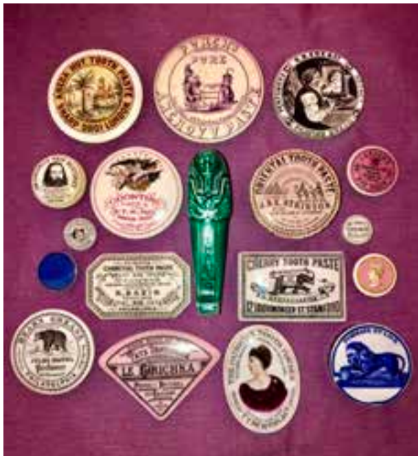
Figure 1. Miscellaneous international lids.

Dental images such as toothbrushes and teeth appeared on a few of the dental related toothpaste pot lids but were in fact quite rare (Figure 2); the majority of pictorial images commissioned by chemists or dentists were cherries or mosque/palm trees. The two most popular types of toothpaste flavours were areca nut and/or cherry. Cherry toothpaste was cherry-coloured by the addition of carmine or Armenian bole. Nothing was added to give the paste a cherry flavour, the description "cherry" being applied merely due to its colour.