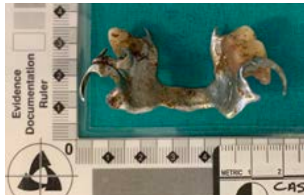
Figure 1. Maxillary chrome cobalt partial denture.

forensic odontology unit at the University of Pretoria for examination and comparative analysis.