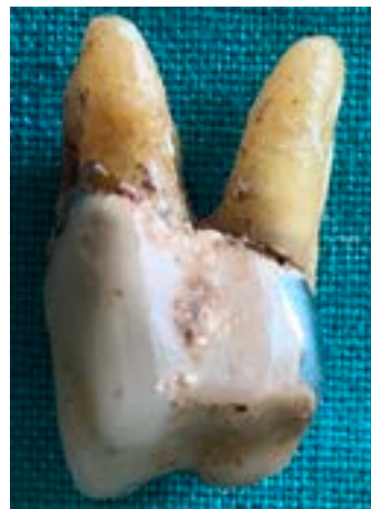
Figure 3. Single maxillary molar tooth.