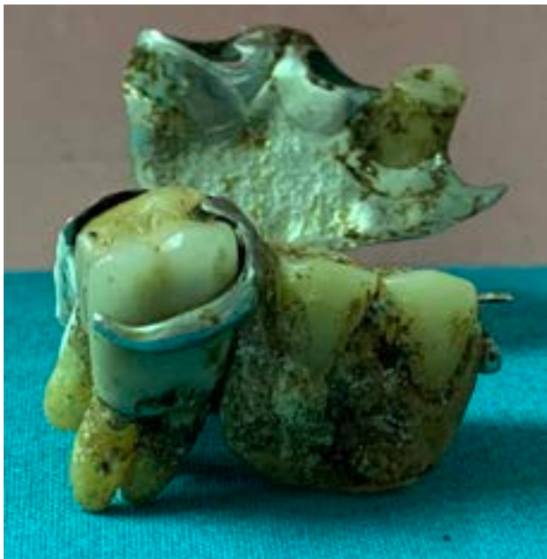
Figure 8. "Buccal" view photograph of the left maxillary first molar tooth in position with the maxillary chrome cobalt partial denture.

Based on the presence of multiple concordant identifiable dental features and no unexplained discrepancies between the antemortem records and the excavated dentures and maxillary molar tooth, it was concluded with absolute certainty that they all belonged to the missing person in question.