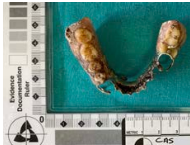
Figure 2. Mandibular chrome cobalt partial denture.