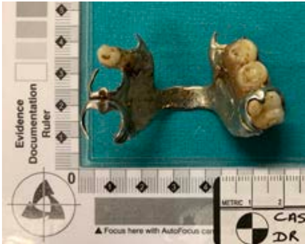
Figure 7. Occlusal view photograph of the left maxillary first molar tooth in position with the maxillary chrome cobalt denture.