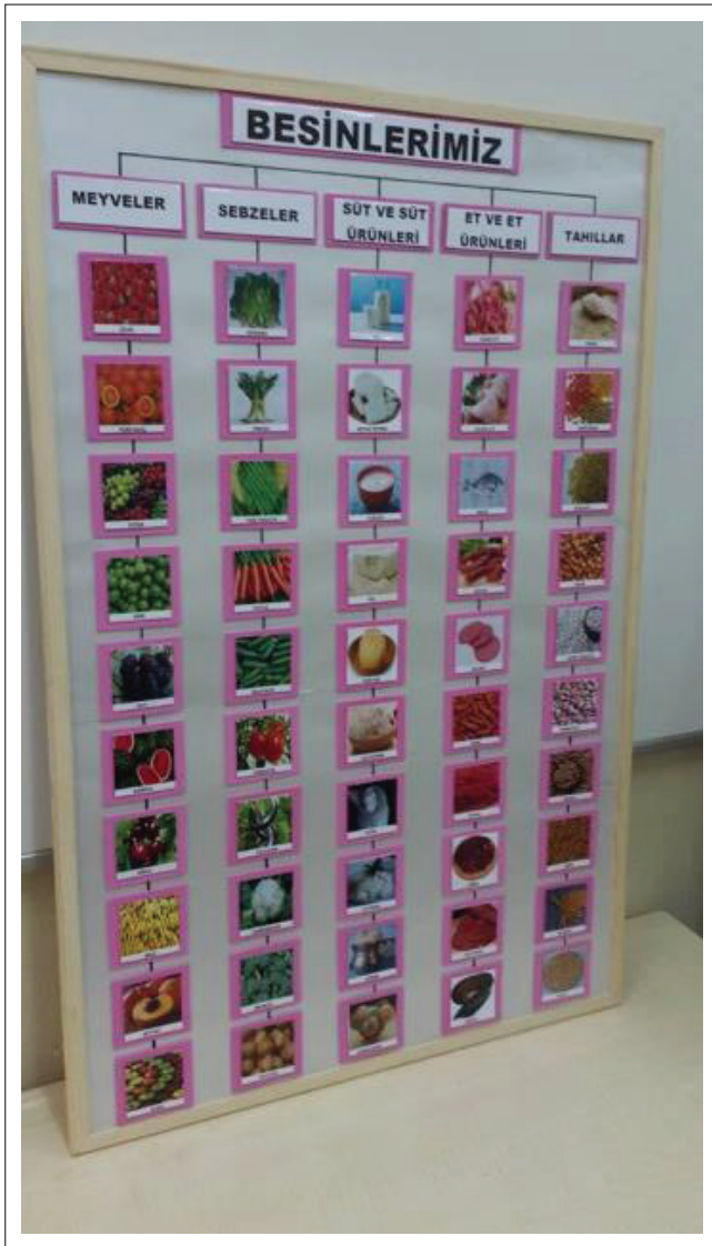
FIGURE 1: An example concept map. (1) Nutrients. (a) Fruits. (b) Vegetables. (c) Milk and milk products. (d) Meat and meat products. (e) Cereals.

Concept maps (see Figure 1) were ordered from the simple to the complicated. Eight concept maps related to items of food, clothes, animals, getting to know their bodies, professions, vehicles and sky were generated and separated into hierarchies in accordance to certain characteristics suitable to children's perceptions.