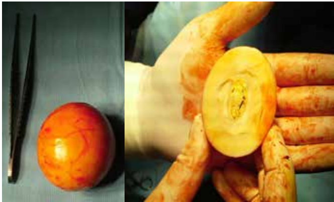
Figure 2: The complete specimen shows a well circumscribed encapsulated yellow mass