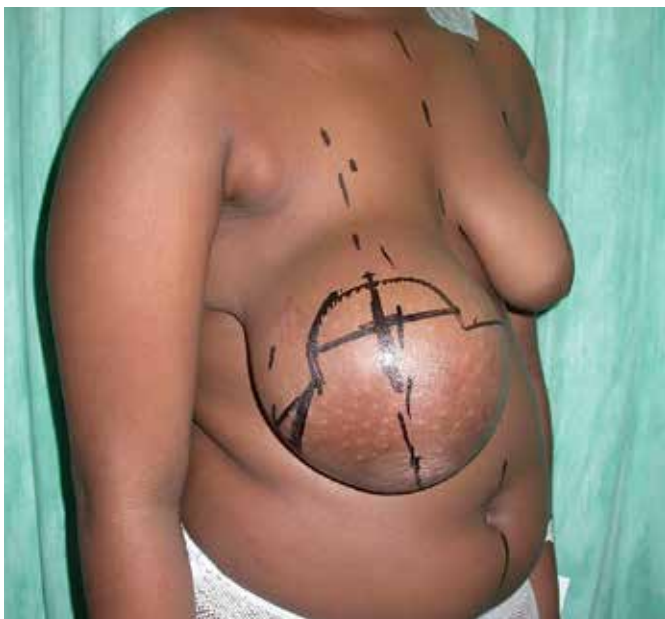
Figure 1a Case 1, 12 years of age with an enlarged right breast due to a giant fibroadenoma mass weighing 1330 g on excision, with a mildly tuberous contralateral breast. The wise pattern marking on the right breast is shown. Measurements of pattern transferred from the normal left side.