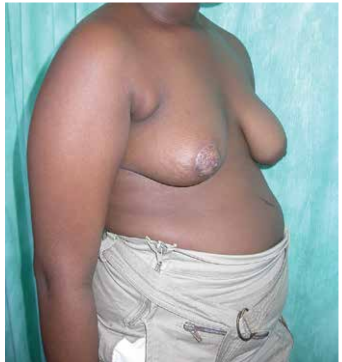
Figure 1c Case 1, at 1 month postoperatively shows a relatively good match to the opposite breast.