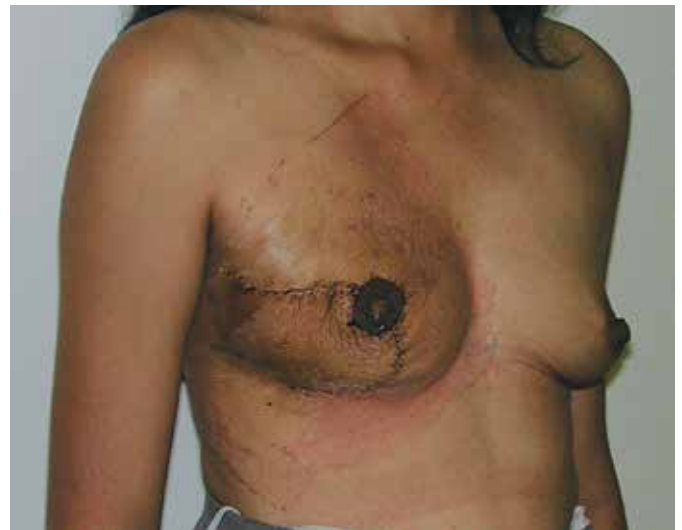
Figure 2c Case 2 at 1 week postoperatively showing the mastopexy closure, NAC reduction and satisfactory breast outcome.

carrying flap, with overlying skin, was designed to be carried on an inferolateral blood supply (Figure 2a). Inferomedial to the NAC pedicle, a crescent of skin was de-epithelialized (Figure 2b). The breast mass with its overlying ulcer and surrounding ellipse of skin, superior to the NAC pedicle, was excised. In closing the created wound, the NAC carrying pedicle with overlying skin filled the outer quadrant defect created by the removal of the mass. An early postoperative result in this case showed a good result (Figure 2c).