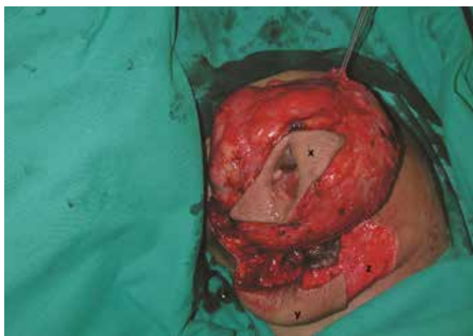
Figure 2b Case 2 shows that the NAC is carried by an inferolateral pedicle that was not de-epithelialized (y) to fill skin defect following the removal of the ulcerated mass (x). A medial crescent of skin on the breast is also de-epithelialized to enhance closure by removal of dog ear portion (z).

carrying flap, with overlying skin, was designed to be carried on an inferolateral blood supply (Figure 2a). Inferomedial to the NAC pedicle, a crescent of skin was de-epithelialized (Figure 2b). The breast mass with its overlying ulcer and surrounding ellipse of skin, superior to the NAC pedicle, was excised. In closing the created wound, the NAC carrying pedicle with overlying skin filled the outer quadrant defect created by the removal of the mass. An early postoperative result in this case showed a good result (Figure 2c).