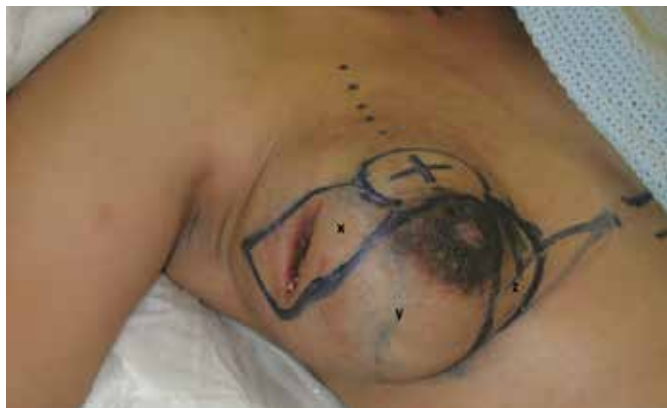
Figure 2a Case 2, 37 years of age shows an enlarged right breast due to a pregnancy onset fibrocystic mass weighing 390 g on excision, with an overlying ulceration. A customised short scar technique approach pattern (sections y and z) is shown marked for the removal of ellipse of skin over the mass (x).

In this case demonstration, an upper outer quadrant breast skin ulcer required a customised reduction mammoplasty approach. The skin reduction was modified to a J shaped short scar technique with the long limb of the J closure running along the lateral aspect of the inframammary fold. The NAC