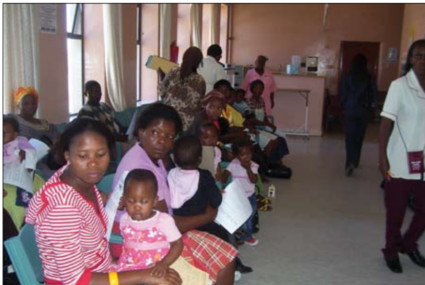
A typical scene in an understaffed rural South African hospital.