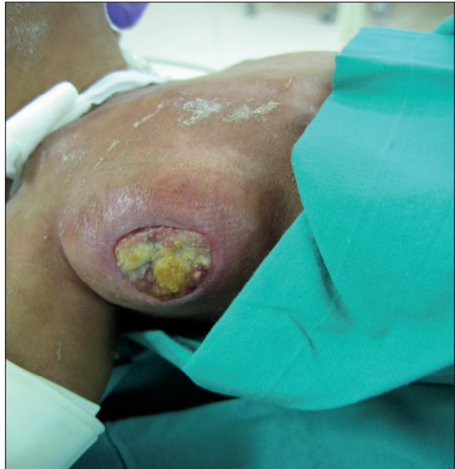
Fig. 2. Axillary BCG lymphadenitis with ulceration.

The average time from starting HAART to the onset of symptoms was 1.4 months. Nine of the 15 infants were placed on TB treatment. A total of 22 interventions were performed