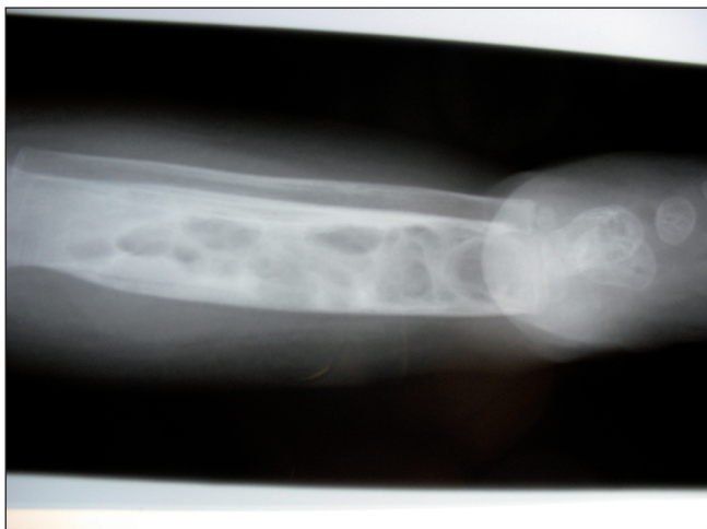
Fig. 1. X-ray of tibia: multiple lytic lesions.

In this series of 15 infants, 11 14 had routine BCG vaccination, administered into the right deltoid area, during the first week of life. Vaccination was delayed for 2 weeks in 1 infant owing to perinatal sepsis. All the infants were HIV positive (PCR analysis). On average, the CD4 count was 664 cells/ \mu l, with a range of 9 - 2 057 (normal values: 500 - 2 010). The average time from inoculation to the development of BCG complication was 6.8 months. Fourteen of the 15 infants were referred for surgery for management of right axillary abscesses or breakdown of nodes (Fig. 2). One child had disseminated disease as detected by gastric washings and positive PCR for M. bovis . Fourteen of the infants received HAART. In 10 patients, the implementation of HAART predated the complications of the BCG vaccine.