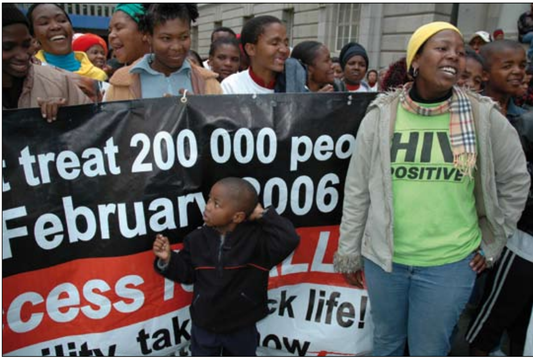
Treatment Action Campaign protestors outside the Cape Town High Court in 2006.

The authors noted that income inequality, low economic development and high levels of gender inequality were strong positive predictors of rates of violence and injury.