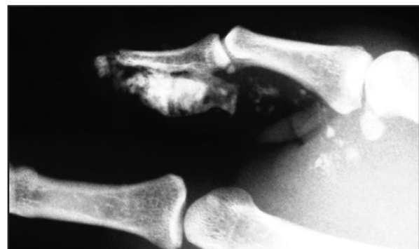
Figure 2. X-ray: radio-opaque paint in region of distal phalanx and tracking down flexor sheath of thumb