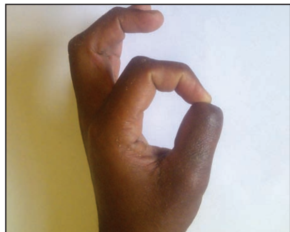
Figure 3. Final post-operative result