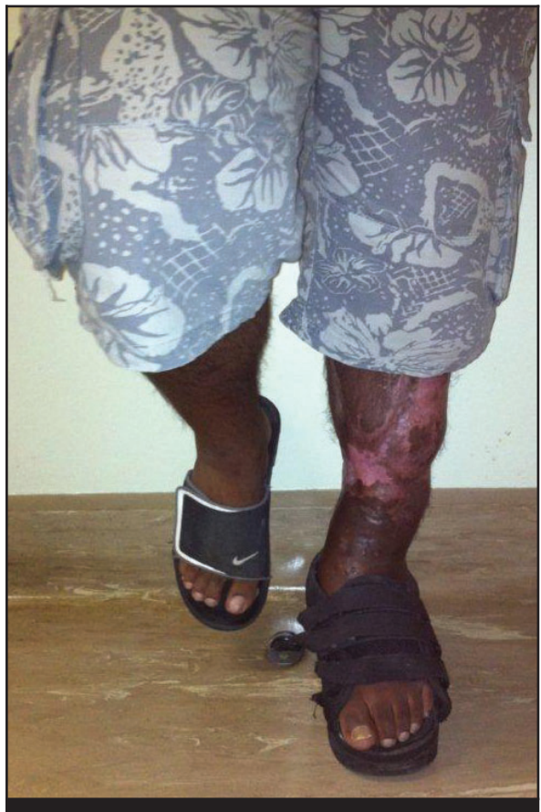
Figure 5. Clinical and radiological outcome after frame removal

Not only could bone continuity be restored through distraction osteogenesis but in this case gradual distraction was successful in facilitating soft tissue reconstruction through distraction histogenesis