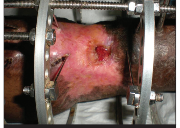
Figure 4. Soft tissue defect after eight weeks of bone transport