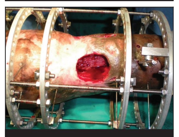
Figure 2. Soft tissue defect after debridement