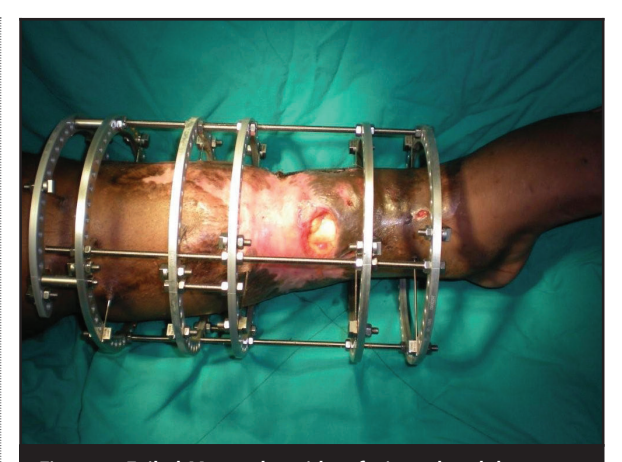
Figure 1. Failed Masquelet with soft tissue breakdown over cement spacer

Two of the most common techniques used to reconstruct large bone defects are bone transport according to Ilizarov principles and bone graft into an induced membrane as described by Masquelet.<sup>18-21</sup> As bone loss is frequently associated with soft tissue defects, either as a result of the primary injury or the subsequent surgical debridement, bony reconstruction is often combined with soft tissue reconstruction.<sup>1</sup>