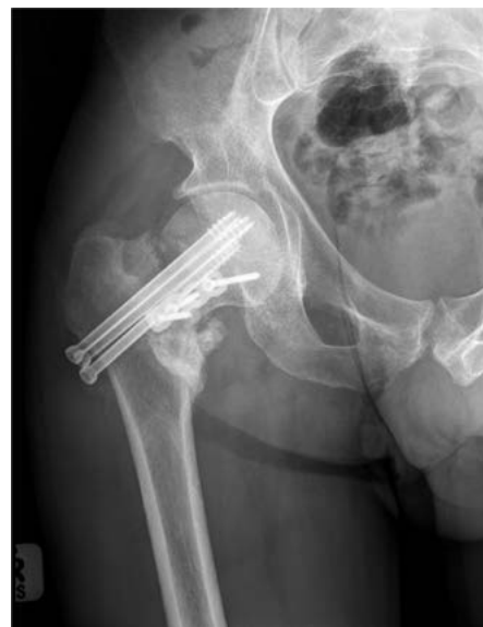
Figure 3. Antero-posterior radiograph of right hip showing non-union and fixation failure