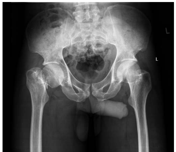
Figure 1. Antero-posterior radiograph with comminuted fracture of the right femoral neck

A total of 108 patients underwent fixation for femoral neck fractures. Twenty-five patients were older than 65 years and were subsequently excluded. Sixteen patients (19%) were lost to follow-up prior to confirmation of union or failure. The final cohort comprised 51 men (76%) and 16 women (24%) with a mean age of 43.9 \pm 12.2 years (95% CI 41.0–46.8; range 23–64) ( Figure 1 ) ( Table 1 ). The median follow-up was 8.7 months (IQR 6.2–17.4).