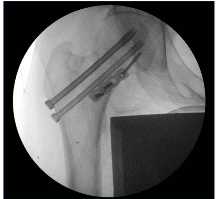
Figure 2. Intra-operative image of reduced fracture with three cannulated screws and calcar plate

Fifty-four patients who sustained displaced fractures completed follow-up to union or failure ( Table III ). Fixation failure occurred in 24 (44%) of these cases ( Figure 3 ). Factors associated with failure included the presence of fracture comminution ( p<0.001 ), the vertical orientation of the fracture line according to the Pauwels