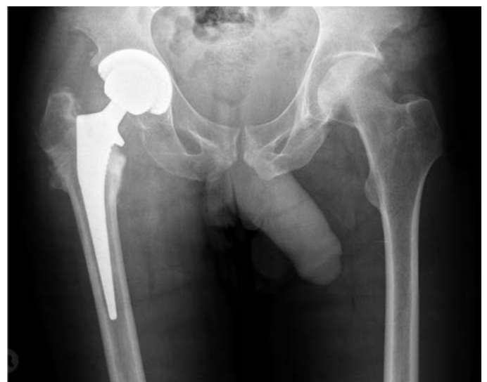
Figure 4. Antero-posterior radiograph showing conversion to right hip arthroplasty