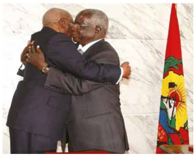
Figure 3: President Armando Guebuza

Concerning resources, Homerin wrote: ^{\rm 129} 'The CCM established ongoing partnerships with international NGOs.' ^{\rm 130}