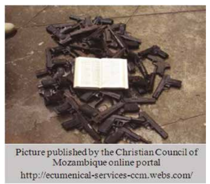
Figure 2: Weapons

Concerning resources, Homerin wrote: ^{\rm 129} 'The CCM established ongoing partnerships with international NGOs.' ^{\rm 130}