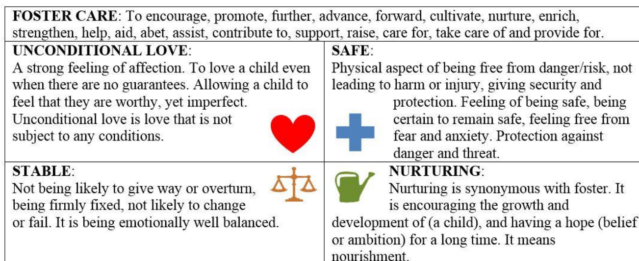
FIGURE 2 THE FOUR QUADRANTS – WHAT THEY MEAN

The four key themes were then ordered into four quadrants. After going back to the root meaning of each key theme (Soanes & Branford, 2002), a word search was conducted to find synonyms for each key theme. As a result of carrying out this word search, a rudimentary assessment framework took shape. This development was consistent with the fact that “a social science model is one that consists mainly of words” (De Vos, Fouché & Delport, 2008:36). The resulting quadrants and descriptions of the key themes are illustrated in Figure 2.